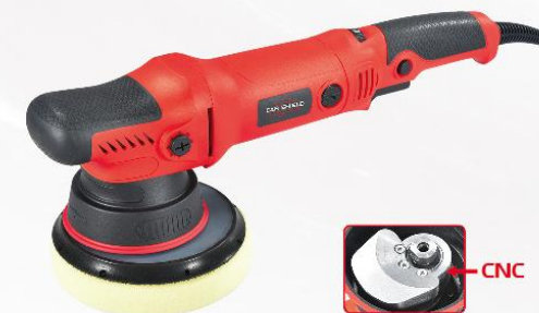
9211 Dual Action Polisher