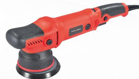
9151 Dual Action Polisher