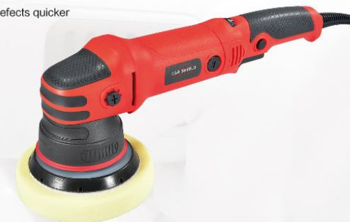
8121 Dual Action Polisher