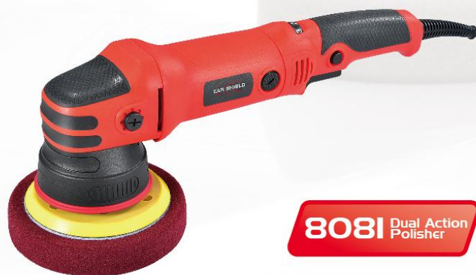
8081 Dual Action Polisher