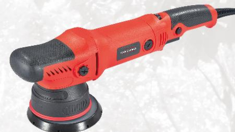
9121 Dual Action Polisher