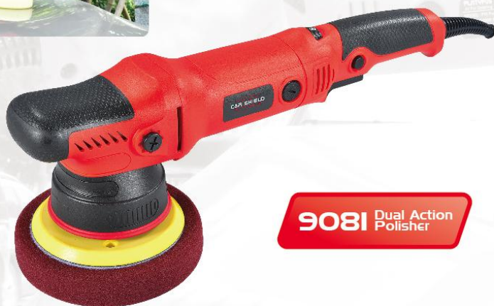
9081 Dual Action Polisher